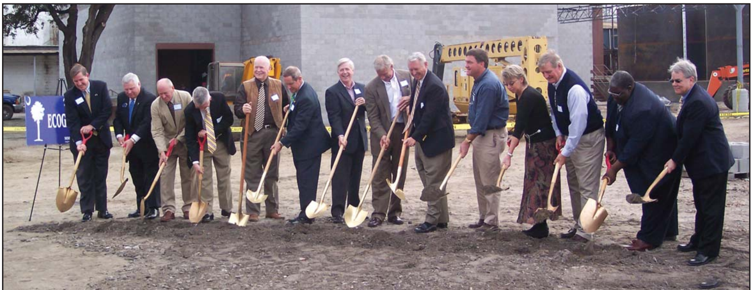
State and local leaders celebrate ground breaking for Ecogy Biofuels

"This announcement is another positive sign that our efforts to improve the soil conditions for business are working to create more new jobs and opportunity in rural South Carolina," said Governor Mark Sanford.