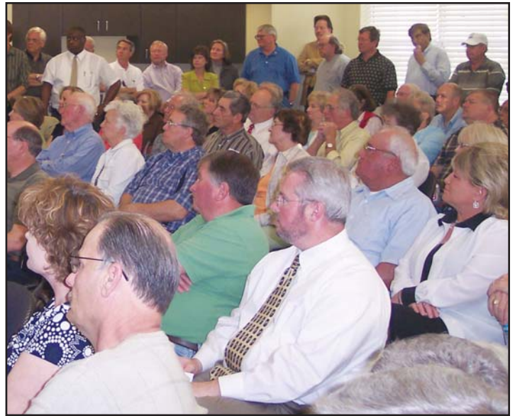
More than 100 citizens attended the Barnwell forum.

For more information on the GNEP project, visit www.gnep.energy.gov .